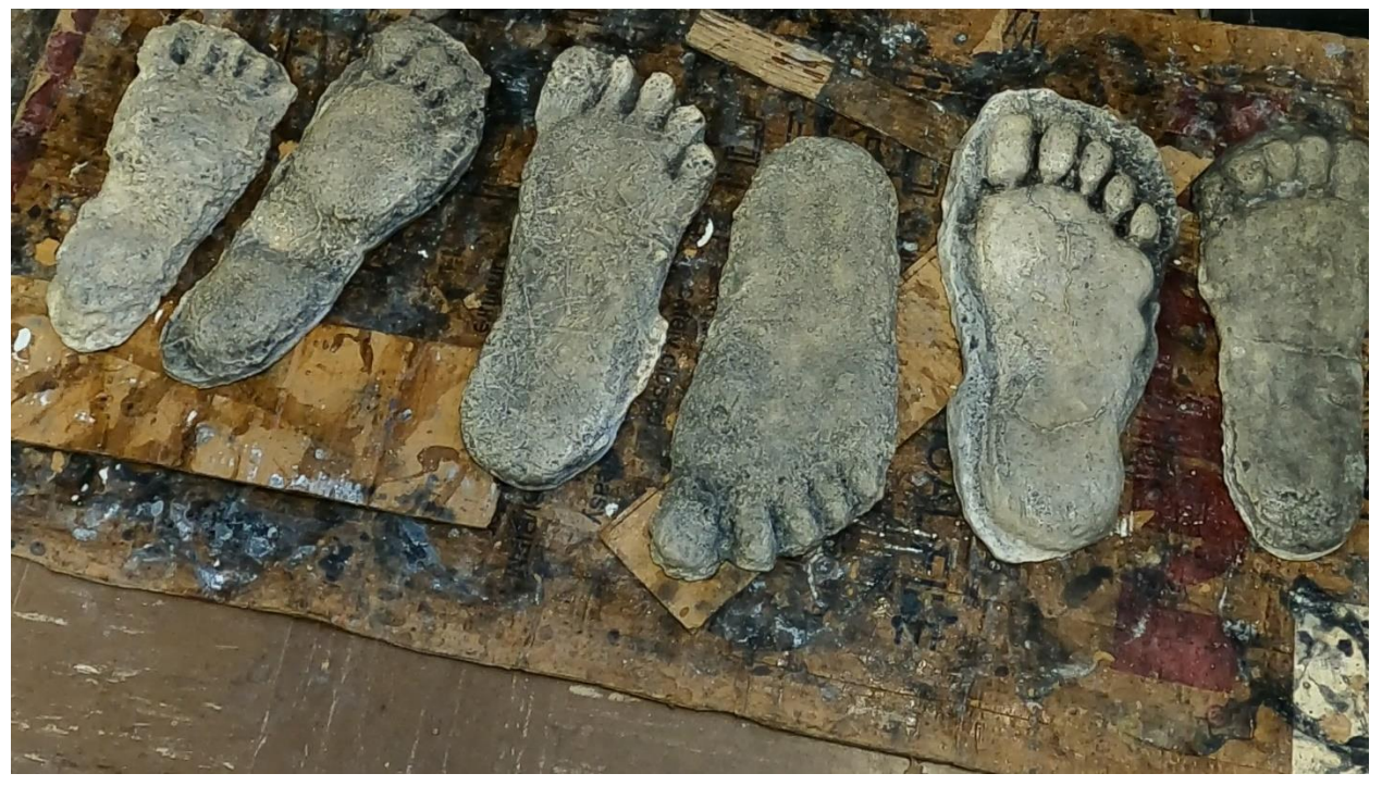
BIGFOOT COLLECTION-A laboratory on the campus of Idaho State University houses more than 300 samples of Bigfoot footprint castings from around the world. The footprints are studied by professor Jeff Meldrum.

"Utah is no exception. The Uintas, the backside of the Wasatch Front, down to the rim of the Colorado Plateau. Boulder Mountain region. These are all areas with a remarkable history and the appropriate habitat. In fact one of the many writing projects I'm engrossed in at the moment is Big Foot in the American southwest. Focusing on the Four Corners area and taking in much of southern Utah." Meldrum said. A visit to his laboratory is a bit like going to a Bigfoot Movie. He has hundreds of footprint casts of the creatures. Meldrum is constantly called on to unravel real sightings from fake ones. He's a foremost authority on the mystery of Sasquatch.