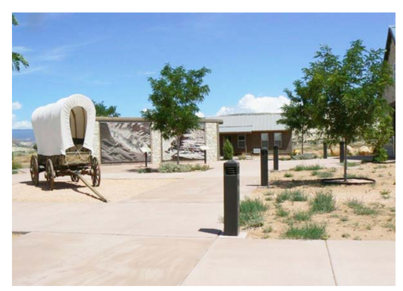
The Hole-in-the-Rock Interpretive Center in Escalante brings to life the "I've been impressed and moved at the desperate story of 250 snowed-in early pioneers who traveled up a red rock bluff at a 45-degree angle for 2,000 feet in order to pass through a hole in the rock to freedom and salvation. It is a prime example of the cooperative effort of the communities in the MPNHA working together to preserve their precious heritage.

perseverance that has gone into getting the MPNHA up and operating, and the way it has leveraged a small amount of federal money to help get millions of dollars of restoration work done.