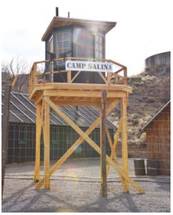
Salina City has restored this state.

The project to restore the camp's three buildings including commander's quarters, a bunk house and a motor pool and repair shop was completed in early November 2016.