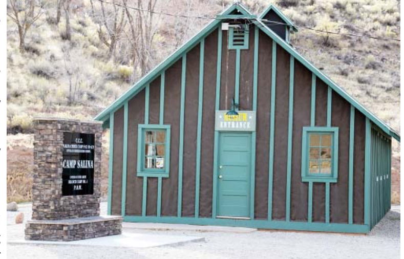
the community and city The restored CCC/POW camp in Salina, Utah, will now serve as a museum.

World War II when it was being used to as a POW camp for 250 German prisoners.