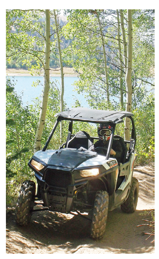
Polaris RZR 900 on the Arapeen OHV Trail #12 east of Fairview Utah. Huntington Reservoir is seen in the background.

The Polaris Foundation donation contributed to the National Park Foundation's <u>Centennial Campaign for America's National Parks</u> and will address these trail infrastructure needs to ensure that MPNHA continues to