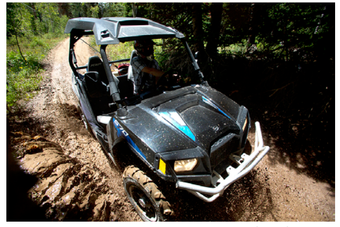
Polaris RZR 570 on the Arapeen OHV Trail #57, near Miller's Flat and Potters Ponds- also east of Fairview, Utah.

Park, located at the mouth of the canyon just to the south, enjoy OHV riding. There are more than 170,000 ATVs, side by sides, and motorcycle enthusiasts in Utah who find that off-roading is a great way to spend time with family and friends while enjoying the outdoors.