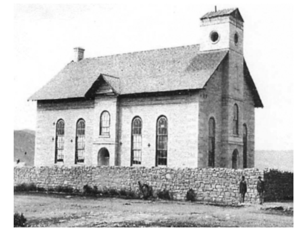
Manti Tabernacle after being constructed in 1903.

"It was constructed in the late 1870s and has significance not just for Manti and Sanpete County, but churchwide as a symbol of faith and courage. For the Mormon pioneers