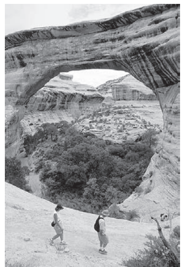
Hikers make their way down the trail to Sipapu Bridge.