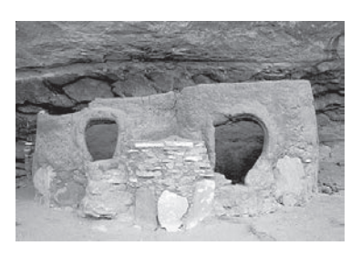
Horsecollar Ruin earns its name from the shape of the doors to these granaries.