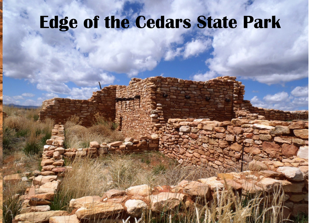
Edge of the Cedars State Park