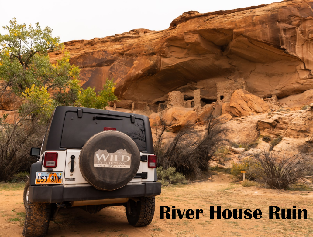
River House Ruin