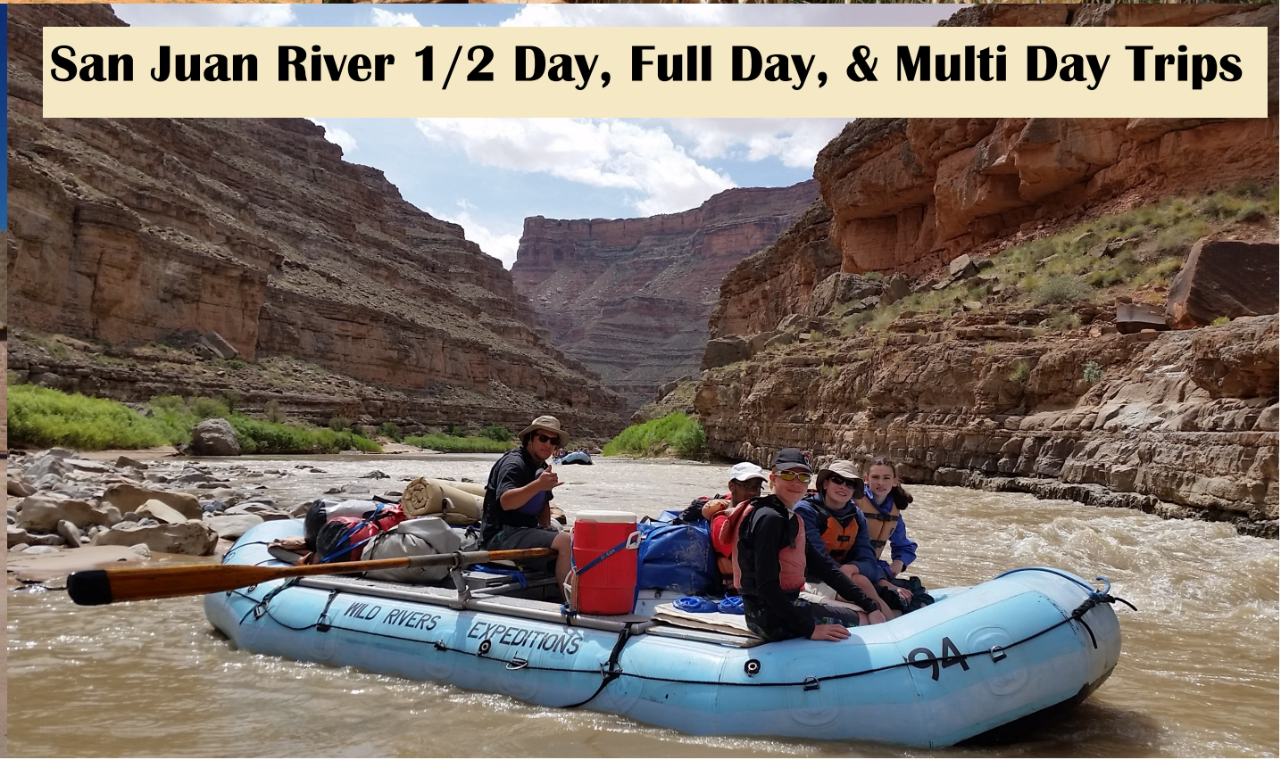
San Juan River 1/2 Day, Full Day, & Multi Day Trips