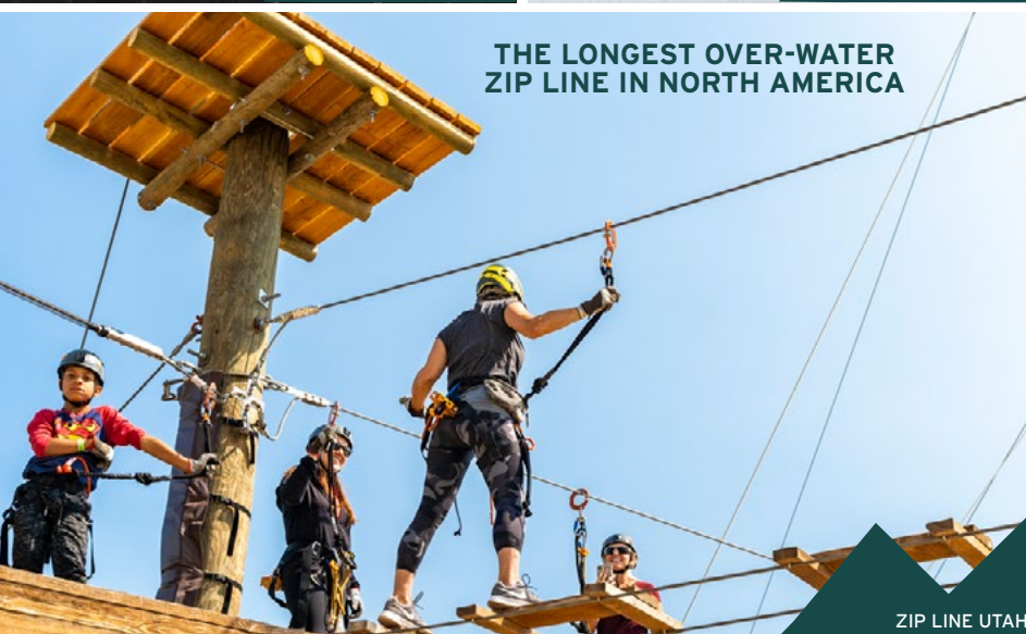
ZIP LINE UTAH