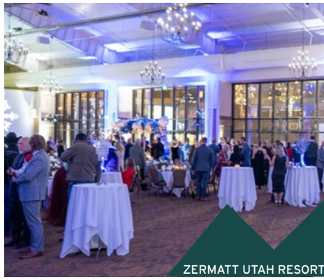
ZERMATT UTAH RESORT

When planning your next meeting or event, why not choose one of the most beautiful mountain settings in Utah to host your group? With a number of meeting spaces, lodging options, and an array of dining and catering options year-round, we're sure you'll find the perfect venue to suit your group's needs no matter the size.