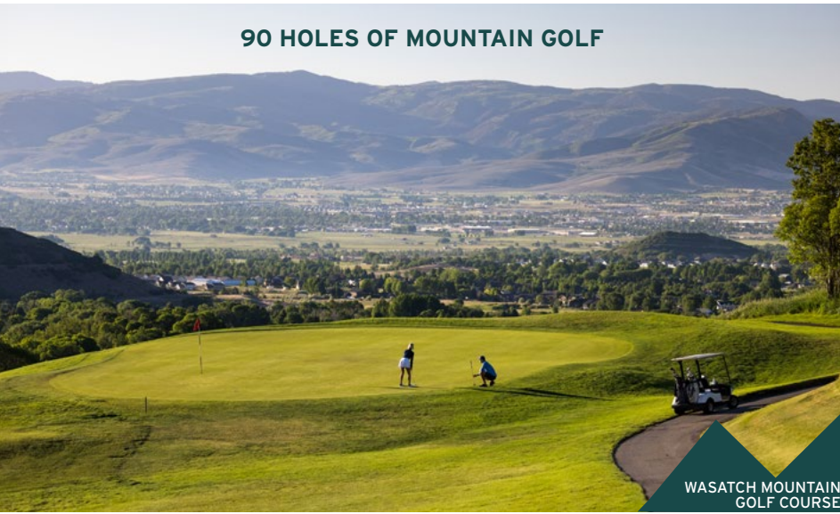
WASATCH MOUNTAIN GOLF COURSE