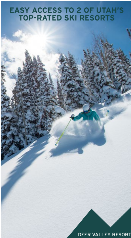
DEER VALLEY RESORT