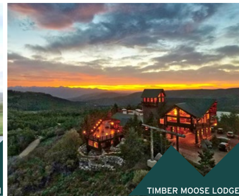
TIMBER MOOSE LODGE