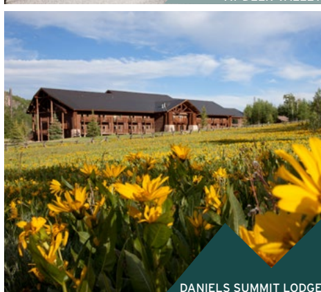
DANIELS SUMMIT LODGE