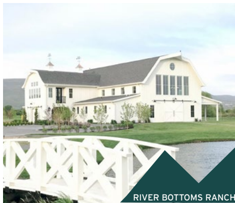
RIVER BOTTOMS RANCH