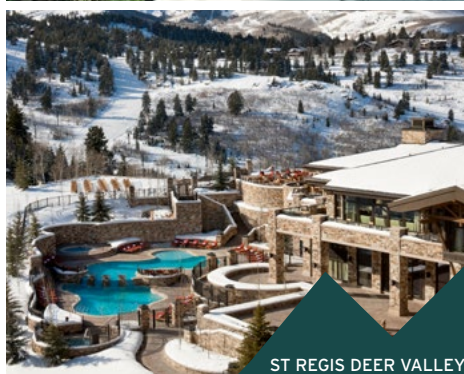
ST REGIS DEER VALLEY